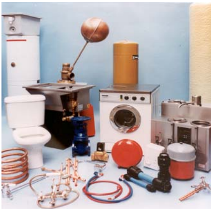
Examples of some of the many types of product approved by WRAS.

WRAS product approvals are usually valid for five years with all currently approved products listed in the fittings section of the WRAS Water Fittings & Material Directory, published on the WRAS website, where it can be viewed free of charge.