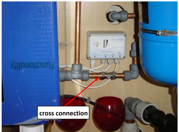
Cross connection between domestic drinking water supply and rainwater harvesting system

In all cases the only means of separating the supplies was an isolation valve, which in three properties was found in the open position. An isolation valve is not a recognised backflow prevention device and the installers committed criminal offences by creating a cross connection without adequate backflow prevention. The Water Fittings Regulations and Scottish Byelaws require fluid category 5 backflow protection, usually by using a Type AA or AB air gap, between mains and reclaimed water.