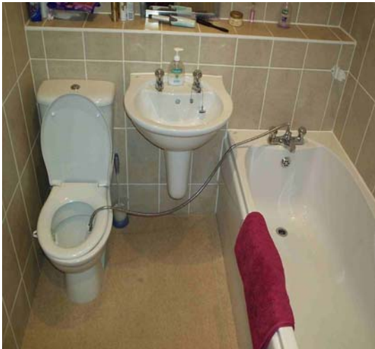
Figure 1a: Bath shower hose which is long enough to reach the WC

The same risk arises from flexible shower hoses installed adjacent to WCs for personal cleansing in place of toilet paper.