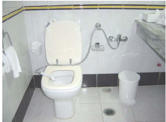
Figure 1b: Shower hose provided for personal cleansing